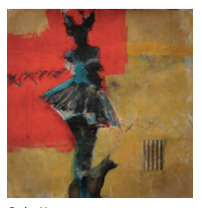
Cathy Hegman Holly Bluff, MS Possessions 37" x 37" $3,600