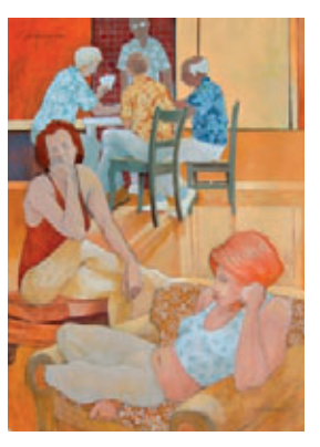
George M. Schoonover Yachats, OR Poker Widows 29" x 20" $1,500