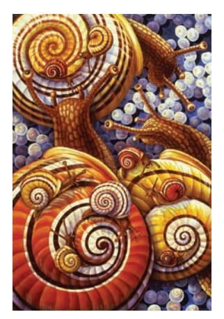
Eileen Mueller Neill Riverwoods, IL Snail Tale 28" x 19" $5,000