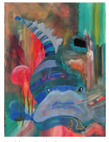
Kathleen Zimbicki Carnegie, PA Blue Mouth Fish 38" x 30" $1,200