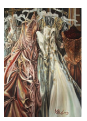
Cindy Brabec-King Palisade, CO Perfect Occasions 30" x 22" $2,400