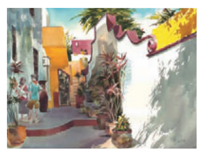
Mike Eagle Old Saybrook, CT Mazatlan Courtyard 30" x 36" $1,200