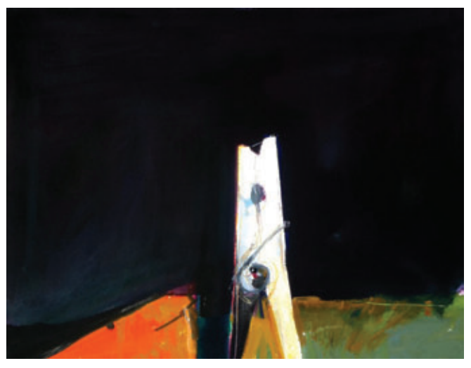
"Red, White and Black" by Skip Lawrence www.skiplawrence.com