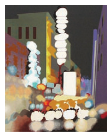
Steve Horan Bella Vista, AZ Night Lights 30" x 24" $2,800