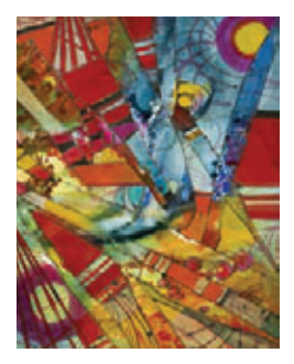
Phiris Kathryn Sickels Pittsburgh, PA Easels 18" x 24" $500