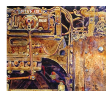
Nancy Stark Roanoke, VA Valve Oil 34" x 31" $2,000