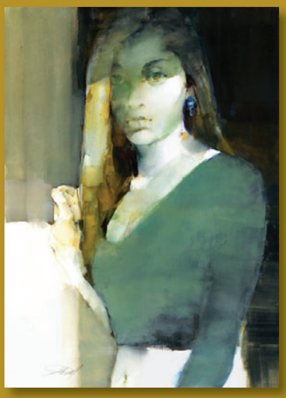
2011 Best of Show "Sapphire" by Jeannie McGuire

PITTSBURGH WATERCOLOR SOCIETY 65TH ANNUAL INTERNATIONAL EXHIBITION