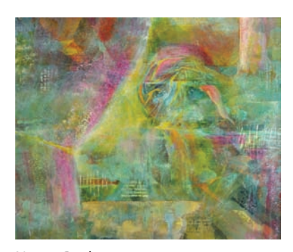
Nancy Bush Moon Township, PA Inside Looking Out 28" x 32" $800