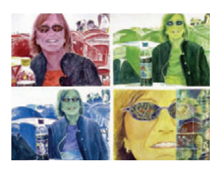
Terry Evers Tucson, AZ Hello Lady 30" x 38" $3,000