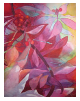
Kay Sandler Columbia, MD Red Berries 22" x 18" $780