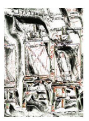
Roy Drasites Chapin, SC Gallery Entrance 22" x 16" $800