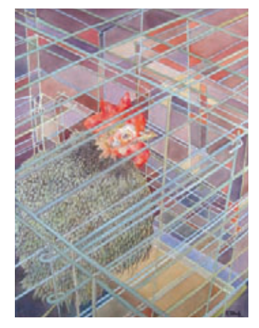
Kathryn Strutz Mars, PA Cagin Chicken 40" x 30" $1,200