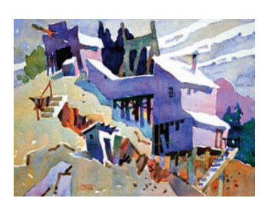
Frank Webb Pittsburgh, PA Gold 28" x 36" $1,500