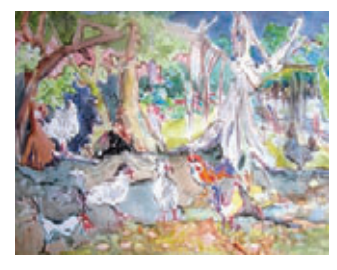
Val Wright Naples, FL Don't Wait For an Invitation 22" x 30" $1,000