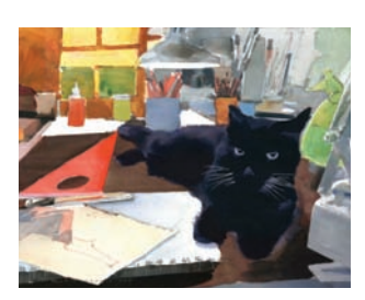
Ron Thurston Pittsburgh, PA Creative Meeuse 20" x 24" $2,000