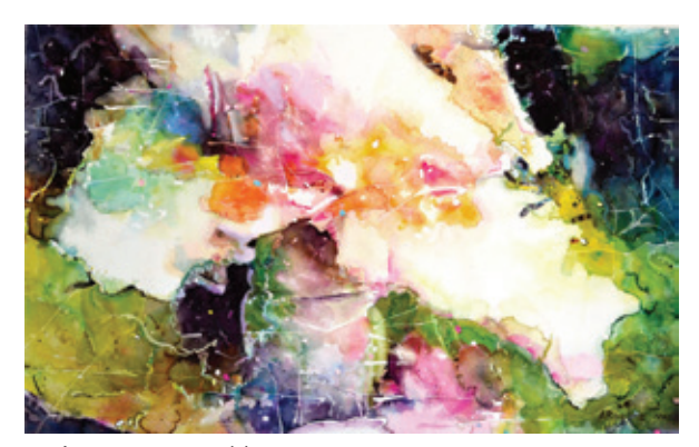
Anthony Rogone Old City Iris Rocklin, Ca. $2,500 28" x 42"