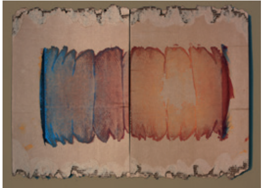
Kazi Ishraki Persistence of Memory Jamaica, N.Y. $500 30" x 40"