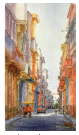
Cynthia Cooley Old Havana Verona, Pa. $1,000 26" x 16"