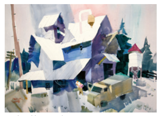
Frank Webb Grain Elevator Pittsburgh, Pa. $900 15" x 22"