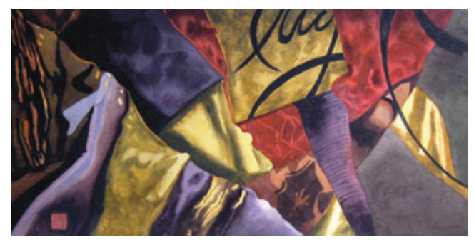
Carol Hubbard Antithesis Monroe, Conn. $2,500 20" x 36"