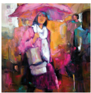
Girl With the Pink Umbrella by Donna Zagotta

Donna's paintings have evolved from an early emphasis on traditional watercolor techniques and traditionally influenced realism to an unconventional use of the watercolor medium and the exploration of the area that lies between realism and abstraction.