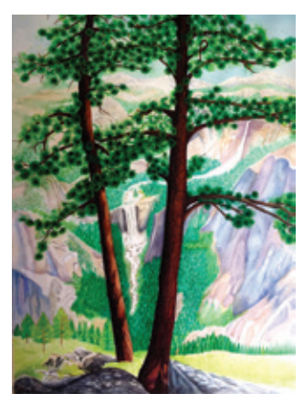
Marguerite Kazalas Glacier Point, Yosemite Pittsburgh, Pa. $2,000 25" x 33"