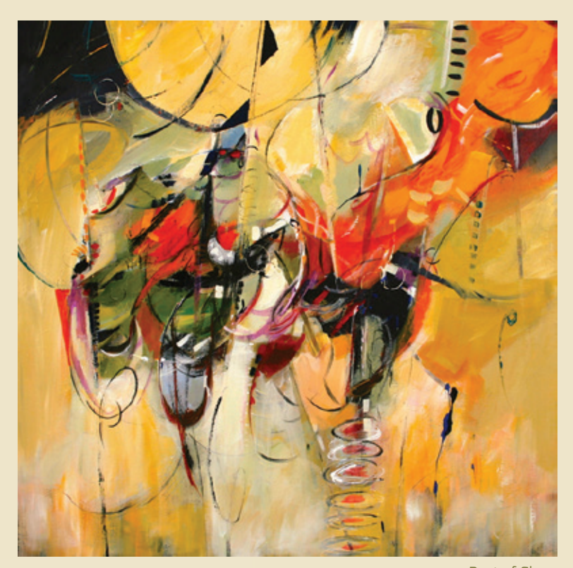
Best of Show Synthesis by Denise Athanas