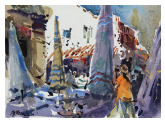
Woon Lam Ng Good Shot Singapore $2,000 11" x 15"