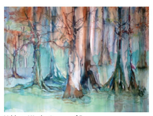
Valdoris Wright Images of Patience Naples, Fla. 51,000 28" x 36"