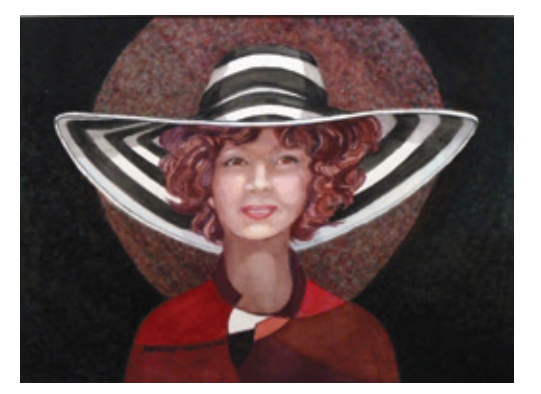
Charlotte Huntley Derby Dress Code Lafayette, Ca. $4,000 22" x 30"