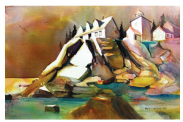
Sally Heston Lighthouse Point Broadview Heights, Ohio $800 22" x 28"