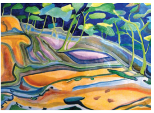
Ann Averback Another Tree on a Hill Pittsburgh, Pa. $2,000 20" x 28"