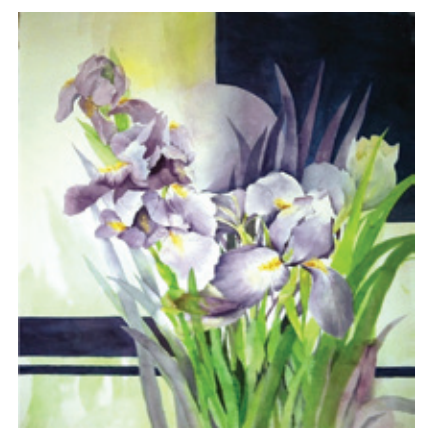
Sally Sheffler Inspired by Iris Crescent, Pa. $700 23" x 22"