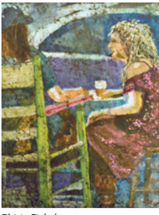
Phiris Sickels Lady in the Strip District Pittsburgh, Pa. $1,000 32" x 40"