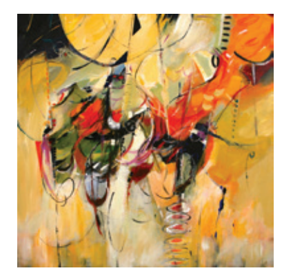
Denise Athanas Synthesis Mt. Pleasant, S.C. $4,200 40" x 40"