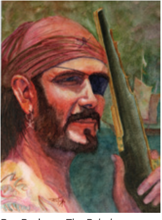
Roc Prologo The Rebel Freedom, Pa. $850 18" x 22"