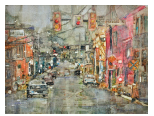
Eileen Sudzina West Newton PA McKeesport, Pa. $1,000 26" x 32"