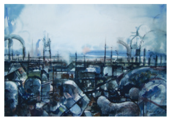
David Reed City Beyond Repair Westerville, Ohio $1.000 14" x 20"