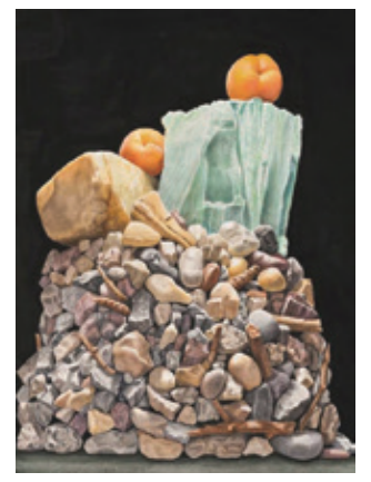
Rosemary Osnato Ascending Women Montague, N.J. $1,100 20" x 26"