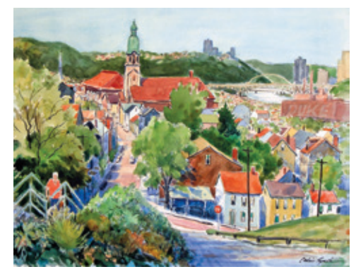
Calvin Lynch Mission Street Confluence, Pa. $1,000 24" x 33"