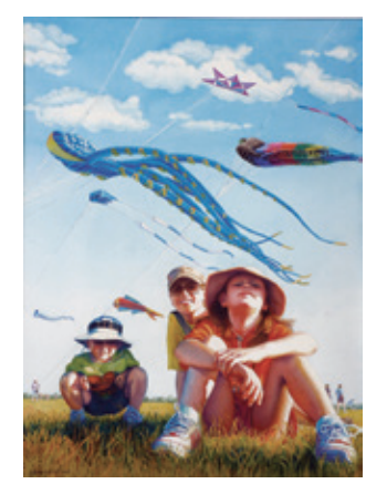
Eileen Mueller Neill Soaring Kite Watchers Riverwoods, Ill. $5,300 37" x 30"