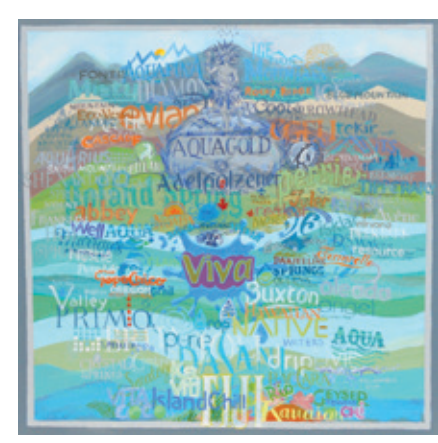
Peaks Paul Johnson Waterbottles Freedom, Pa. $700 36" X 36"