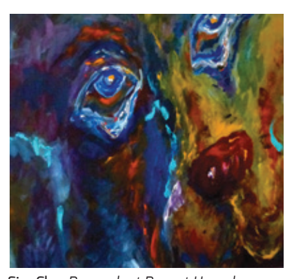
Sim Cha Benevolent Basset Hound Pittsburgh, Pa. $4,000 30" x 36"