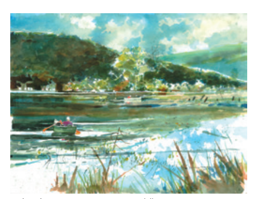
Roland Stevens Morning Paddle Pultneyville, N.Y. $1,650 24" x 30"