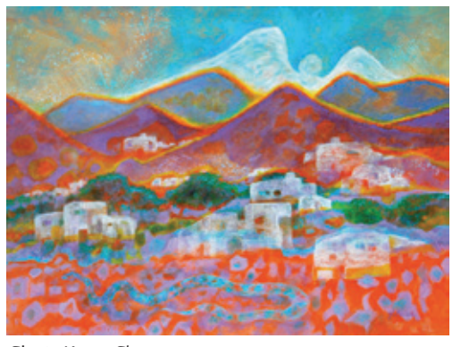
Gloria Karn Choice Pittsburgh, Pa. $850 29" x 21"