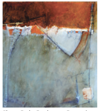
Elaine Daily-Birnbaum Penumbra Fitchburg, Wis. $3,800 30" x 30"