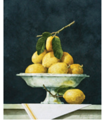
Gary Eckhart Lemon Compote Warren, Vt. $1,100 19" x 15"