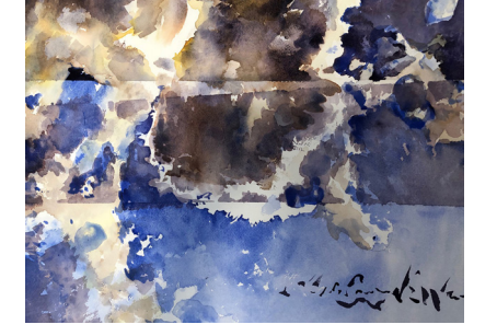
Before The Storm Watercolor