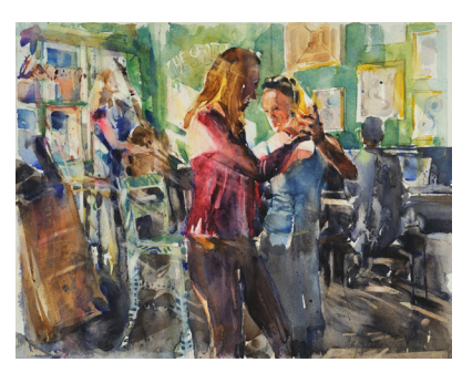
Girls are Dancing Watercolor $600.00 Ray Goodrow