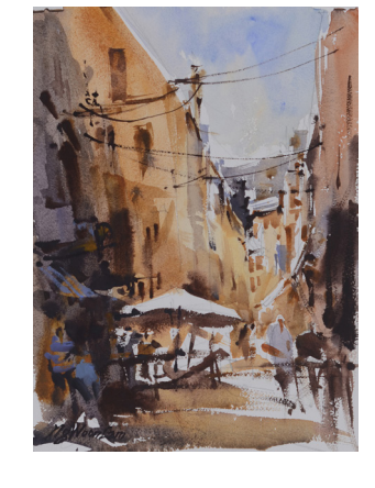
Coffee Time, Brussels Watercolor & Gouache