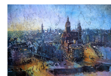
Amsterdam Skyline- Netherlands Watercolor Batik on Japanese Rice Paper