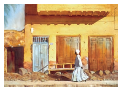
PAT DISPENZIERE Poway, CA "Morning Stroll In EDFU" 36x28 $2,600