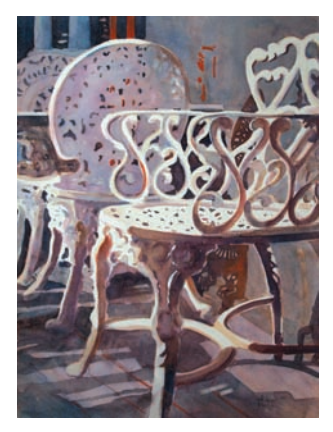
NEL DORN BYRD Plano, TX "Seating at Grant's Corner" 30x38 $2,000