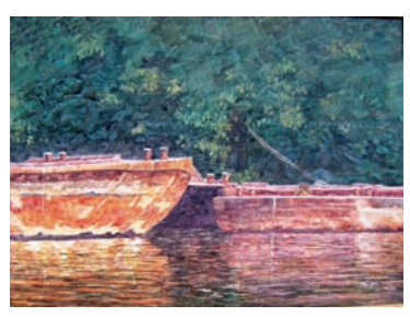
MARY LOIS VERRILLA Pittsburgh, PA "Quiet Reflections" 27x20 $1,200