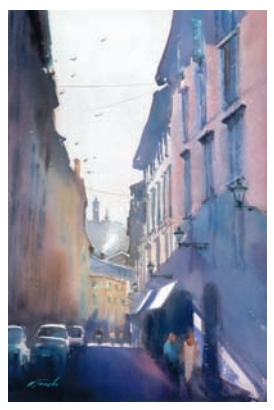
KEIKO TANABE San Diego, CA "Bergamo VIII" 22x28 $1,350