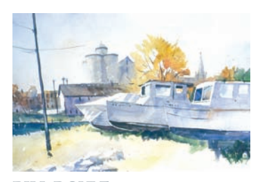
BILL DOYLE Green Bay, WI "Seasons Closed" 27x21 $450