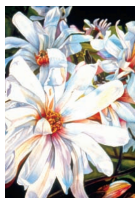
MISSI PAUL Lincoln, NE "Magnolia Vivace" 31x39 $2,200