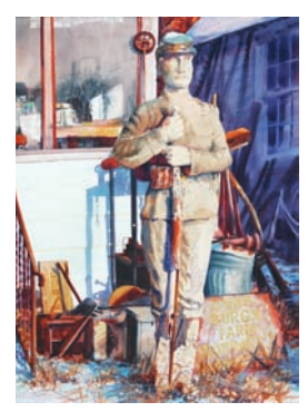
WILLIAM T. PERRY Harmony, PA "Standing Watch" 29x36 $2,000