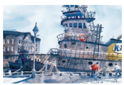
DANA STEADMAN Wexford, PA "Bering Sea" 28x22 $400