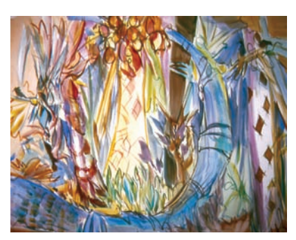
VAL WRIGHT Naples, FL "A Simple Plan" 36x28 $1,000