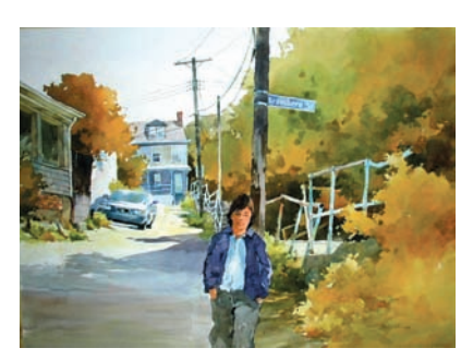
WILLIAM M. VRSCAK Pittsburgh, PA "South Side Kid" 37x29 $1,600