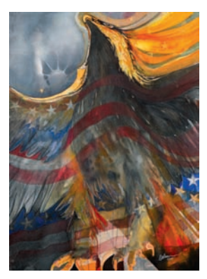
DONALD NELSON Beaver, PA "Out of the Ashes" 30x37 $3,000