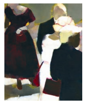
JEANNIE McGUIRE Pittsburgh, PA "The Occasion" 22x27 $1,500