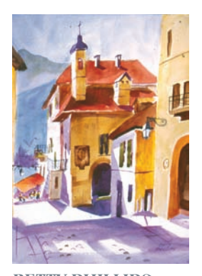
Aliquippa, PA "Orta" 16x20 $450