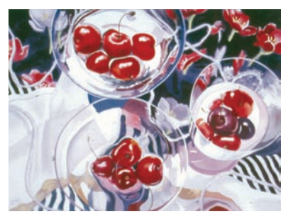
CAROL HUBBARD Monroe, CT "Cherry Wine" 35x27 $4,000