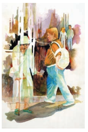
ROC PROLOGO Wexford, PA "Invisible" 21x28 $950