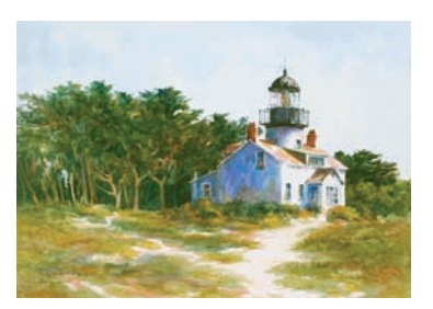
THOMAS SORRELL Sylvania, OH "Pacific Grove Light" 26x20 $500