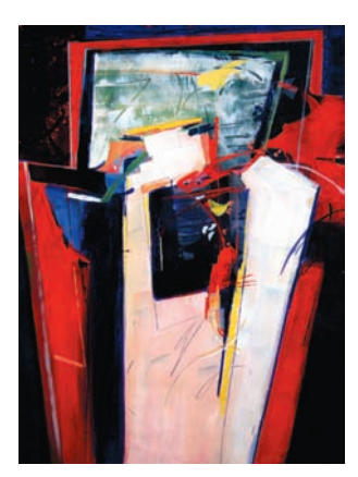
DENISE ATHANAS Mt. Pleasant, SC "Window to the Future" 30x38 $1,800