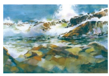
DON GRAEB Glenshaw, PA "The Force" 29x22 $750