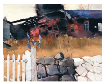
RON THURSTON Pittsburgh, PA "Water Repeler" 34x29 $1,200