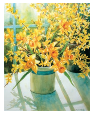
PHYLLIS KOEHLER Mt. Pleasant, PA "Spring Floral" 24x28 $850