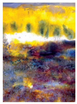
PAT SAN SOUCIE Clackamas, OR 97086 "Bright Landscape" 24x32 $1,000