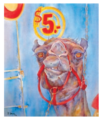
KATHRYN STRUTZ Mars, PA "The Cost of Diesel" 30x30 $1,200