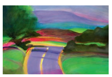
MONICA WILKINS Morgantown, WV "Country Road" 27x191/2 $900