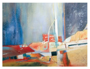
BARRY WINSAND Pittsburgh, PA "Planetarium" 30x23 $450