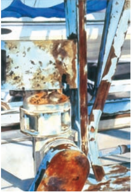
SUSAN STEPHAN FOSTER Export, PA "Rusted Winch" 23x30 $750