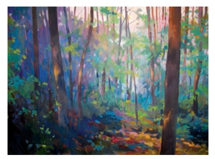
CHRISTOPHER LEEPER Canfield, OH "Evening Tranquility" 47x33 $3,000