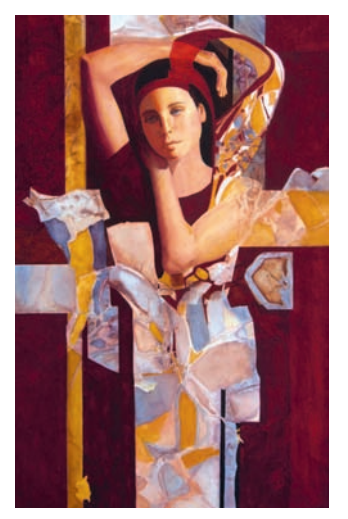
DIANE SCHMIDT Sarasota, FL "Soothsayer" 33x48 $5,800