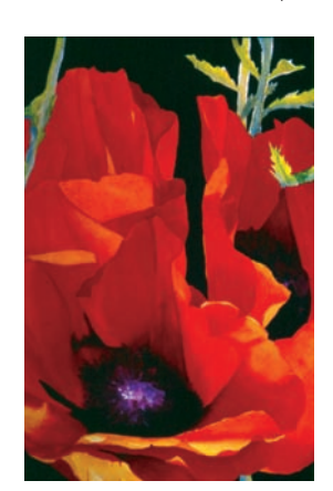
KAY SANDLER Columbia, MD "Poppy Love #4" 30x38 $1,600