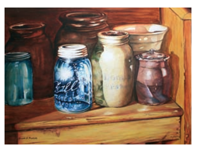
KENNETH W. WADDELL Belington, WV "Light, Shadow, and Reflection" 32x26 $950