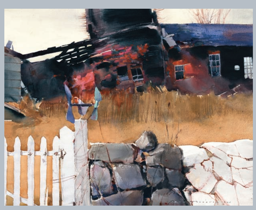
{\color{blue} {\sf BEST\ OF\ SHOW}} "Water Repeler" by Ron Thurston