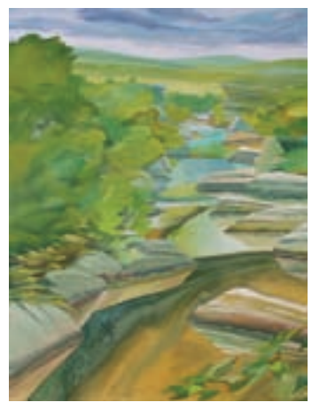
#58 BARRY WINSAND Pittsburgh, PA "Slippery Rock Creek" 30x38 $750