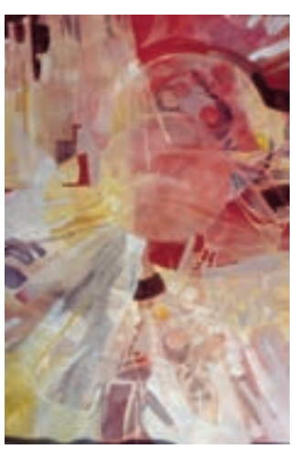
#46 SUSAN E. POLLINS Greensburg, PA "Connect: Red" 19x25 $795