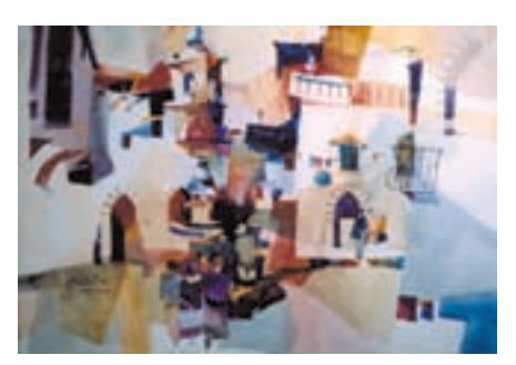
#12 RATINDRA DAS Wheaton, IL "Music In Stone" 28x36 $2,000