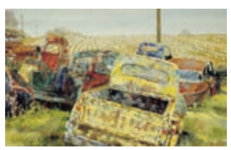
#43 KIT PAULSEN Washington, PA "Studebakers" 26x35 $850