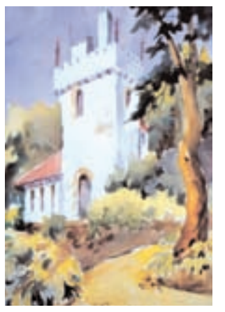
#45 BETTY PHILLIPS Aliquippa, PA "The Castle" 16x20 $350