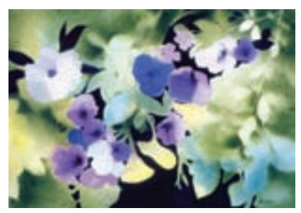
#57 JEAN WEST Pittsburgh, PA "Lavender Lovelies" 30x38 $1,000