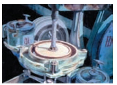
#24 CAROL HUBBARD Monroe, CT "Green Machine" 28x36 $2,500