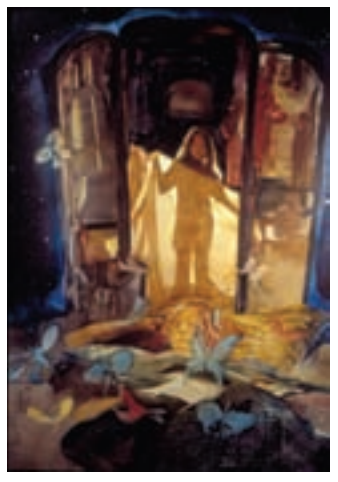
#27 RUSSELL JEWELL Easley, SC "Cocoon" 28x35 $1,600