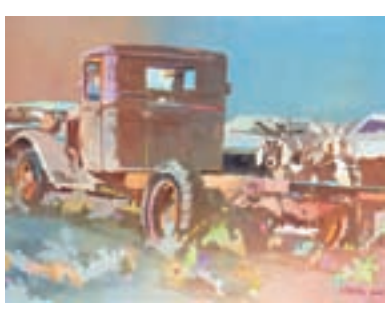
#3 JUDI BETTS Baton Rouge, LA "Four On The Floor" 31x39 $2,300