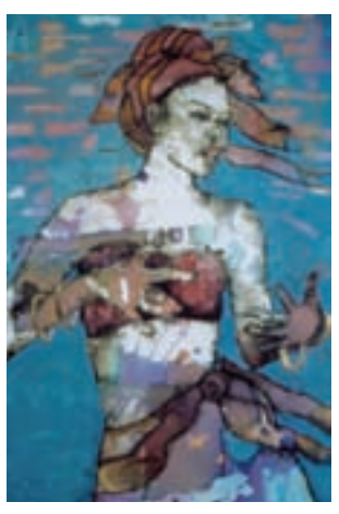
#36 MARIANNE MARINO Allison Park, PA "Drumbeat" 23x32 $1,000