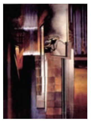
#14 H.C. DODD Houston, TX "Blues II" 28x36 $1,950