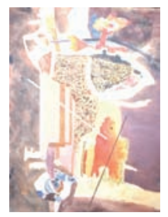
#34 GUY LIPSCOMB Columbia, SC "Gabriels Gate" 29x39 $1,400