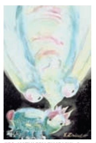
#59 KATHLEEN ZIMBICKI Carnegie, PA "Dive Bombing" 22 x28 $700