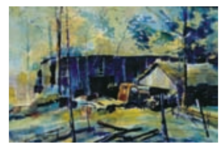
#52 ROLAND E. STEVENS, III Pultneyville, NY "Tennessee Farm" 24x30 $850