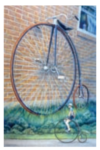
#42 EILEEN NEILL MUELLER Riverwoods, IL "High Wheeler" 28x38 $4,000