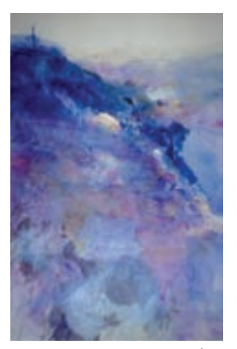
#48 LUELLA PRIORE Coraopolis, PA "Blue Mountain" 30x38 $1,200