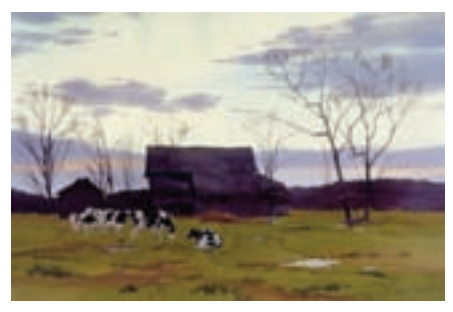
#47 JOEL POPADICS Wayne, NJ "Last Light" 30x36 $2,500