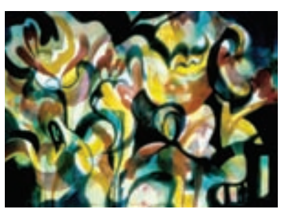
#7 NANCY BUSH Moon Township, PA "Tip-Toe Through The Tulips" 30x38 $800