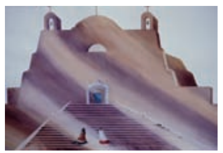
#2 GLORIA BAKER Evansville, IN "Door of the Spirit" 28x36 $2,200