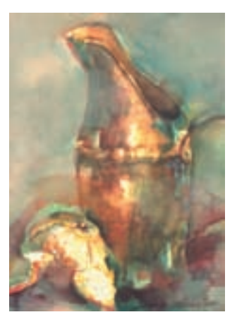
#25 LINDA HUTCHINSON Kent, OH "Turkish Pitcher and Orange" 20x25 $650