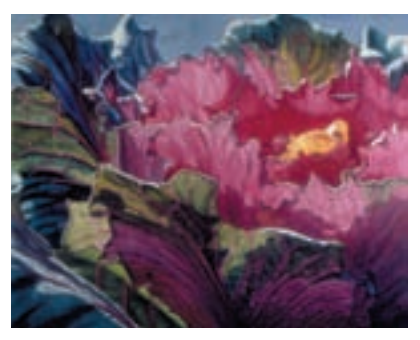
#56 DEBI WATSON Lancaster, PA "Revolution" 32x36 $1,200