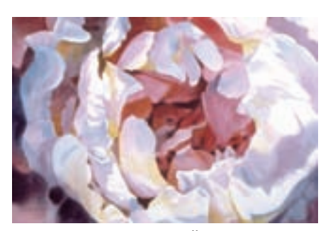
#44 ANN PEMBER Keeseville, NY "Ode to Joy" 22x28 $1,200