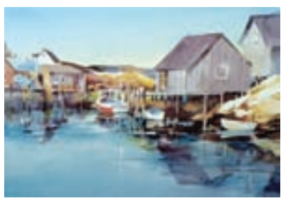
#20 DON GRAEB Glenshaw, PA "Peggy's Cove" 22x29 $1,400