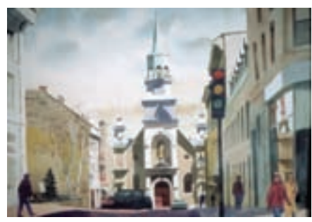
#29 HOWARD KAYE Lincoln, NE "Montreal Church" 27x35 $1,500