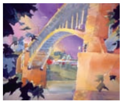
#54 RON THURSTON Pittsburgh, PA "Polish Hill" 27x29 $1,200