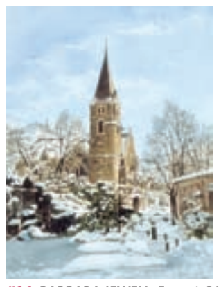
#26 BARBARA JEWELL Export, PA "Mountain Sanctuary" 18x22 $1,000