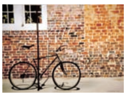
#32 JAMES R. LEFEBVRE East Liverpool, OH "Back in Five" 27x35 $1,600