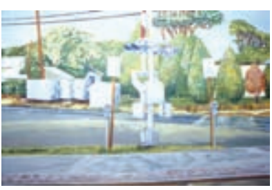
#8 MICHAEL COHEN Long Beach, NY "The Warwick Crossing" 23x28 $1,500