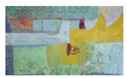
#28 GLORIA STOLL KARN Pittsburgh, PA "The Gift" 13x18 $1,100