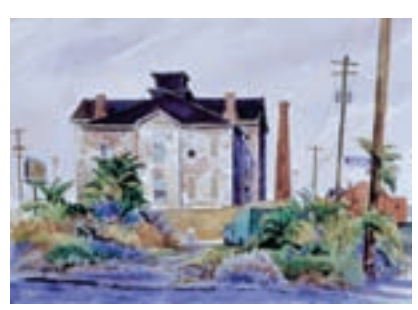
#35 CALVIN LYNCH Pittsburgh, PA "Old Springfield School" 20x26 $1,400