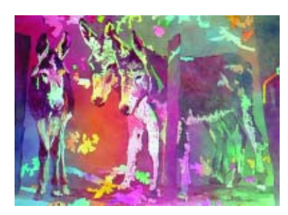
JUDI BETTS , AWS Baton Rouge, LA Tres Amigos 30x38 $2,500