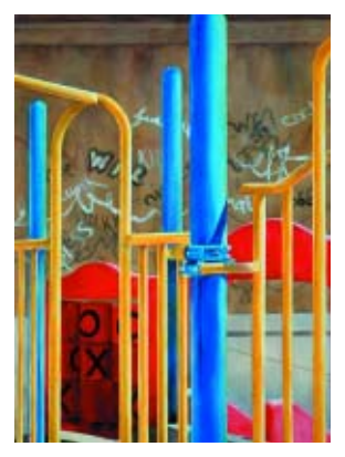
SUSAN STEPHAN FOSTER Export, PA The Playground II 36x28 $1,200