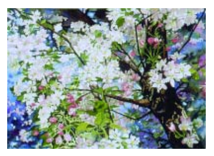
BARBARA JEWELL Export, PA Burst of Spring 18x22 $1,200