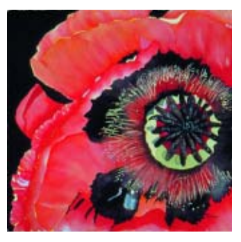
RAMONA POLEN Murrysville, PA Elegant Poppy 26x26 $600