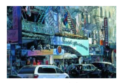
JOHN T. SALMINEN Duluth, MN Mott Street, Ping 31x45 $4,500