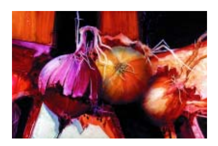
JERRY ZELINSKAS Canton, OH Onion Delight 32x42 $3,000