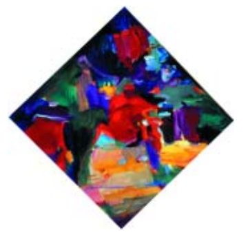
TED VAUGHT Portland, OR Bach Breakthrough 28x28 $1,000