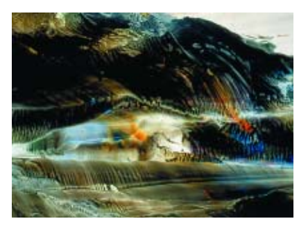
SHEILA CAPPELLETTI Sunnyside, NY Neptune's Wrath 16x20 $400