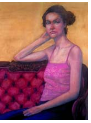
AL ZERRIES Huntington, NY Amelia 33x27 $5,000