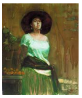
IRWIN GREENBERG New York, NY The Large Red Hat 17x16 $4,000