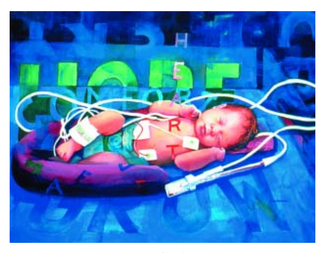
Neonatal Unit #1