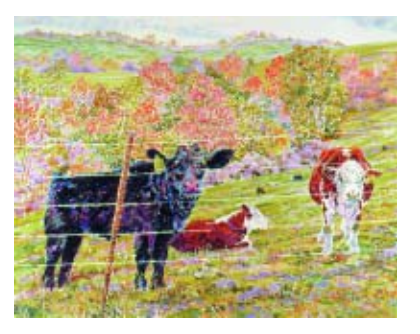
KIT PAULSEN Washington, PA My Neighbor's Cows 28x34 $1,250