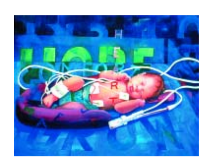
CHRISTINE SWANN Gibsonia, PA Neonatal Unit #1 20x28 $2,000