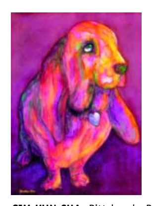
SIM KUN CHA Pittsburgh, PA Cosmo: In Full Bloom 38x30 $2,400