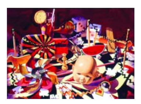
CAROL HUBBARD Monroe, CT In Your Dreams 28x36 $2,500