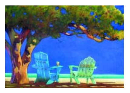
STEVE "CEDAR" JAMESON N. Myrtle Beach, SC Two Beach Chairs 24x30 $2,600