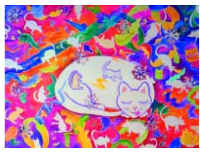
JAN POCIERNICKI Moon Township, PA Cosmic Cat 28x36 $1,500