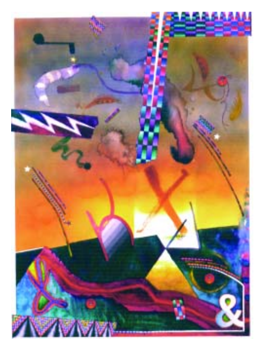
Thunderclap Near the Sea of And