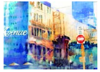
DON GRAEB Glenshaw, PA Reflecting on Saks 23x29 $750