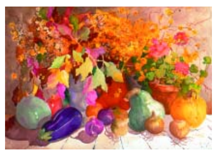
CATHERINE WEISZ Pittsburgh, PA Fall Fantasy 30x40 $800