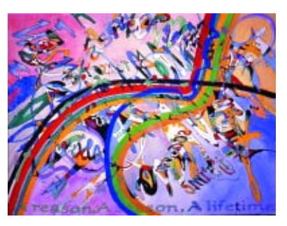
SHERRIE PLONSKI Coraopolis, PA Lifelines 28x34 $800