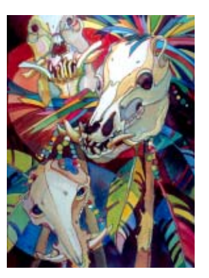
CHARLOTTE HUNTLEY Lafayette, CA Voodoo Picnic 36x28 $3,500