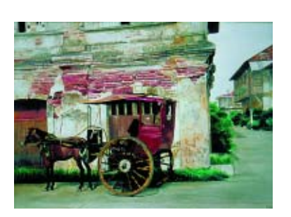
LUIS LLARINA Charlotte, NC Side Street 28x36 $2,900